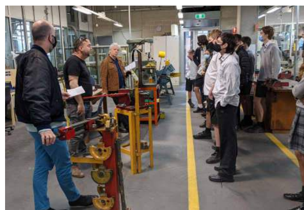
Students on a guided tour of UniSA's studios.