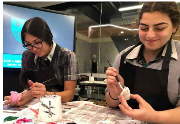
Year 10 students painting their clay art piece.