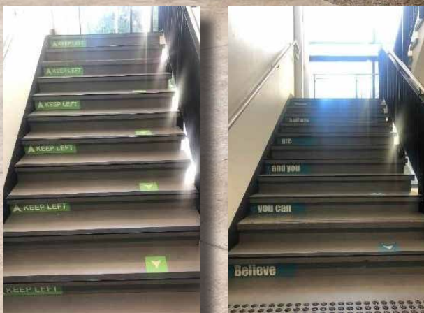
Signage to communicate correct use of stairs and LED cube animation (top) demonstrating safe use of school front.