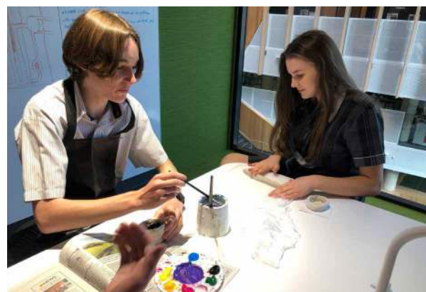
Year 10 students painting their clay art piece.