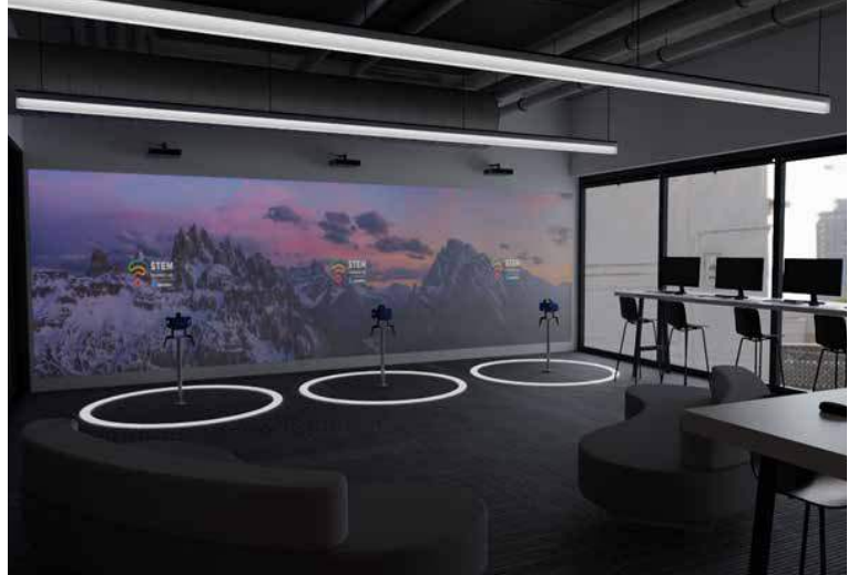
Innovation lab concept design for Adelaide Botanic High School.