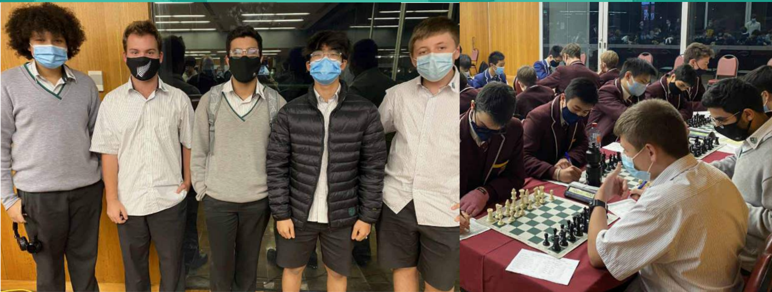
ABHS students attending the school's first South Australian Junior Chess League tournament.