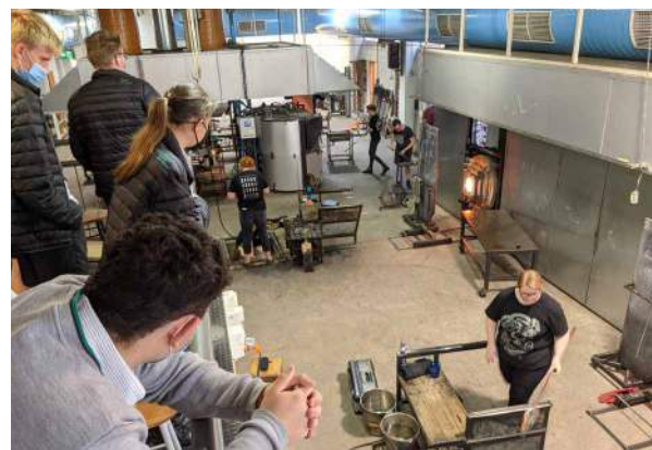
Students on a guided tour of the JamFactory.