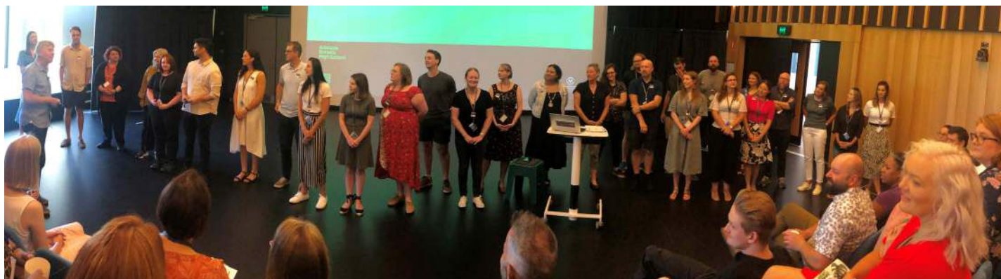
Introduction of 2021 new staff members