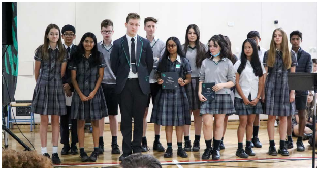
Year 9 Excellence in Learning Award recipients.