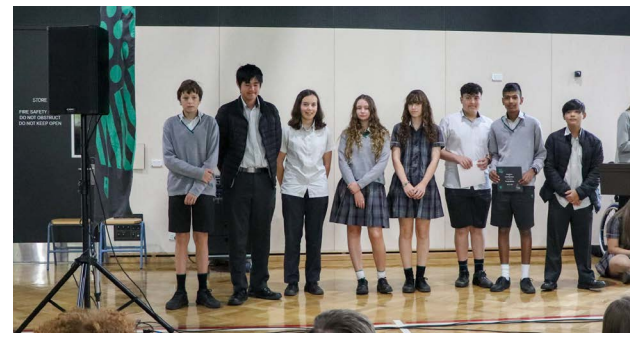
Year 8 Excellence in Learning Award recipients.