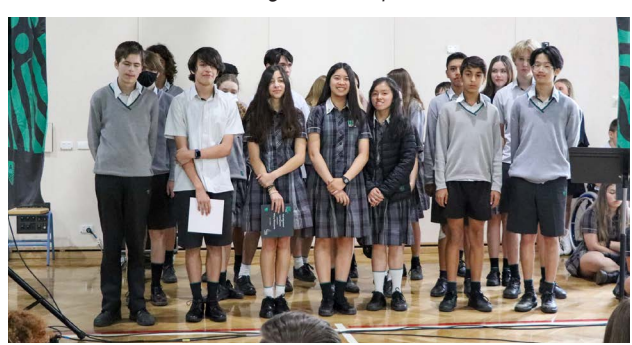
Year 9 High Achievement in Learning Award recipients.