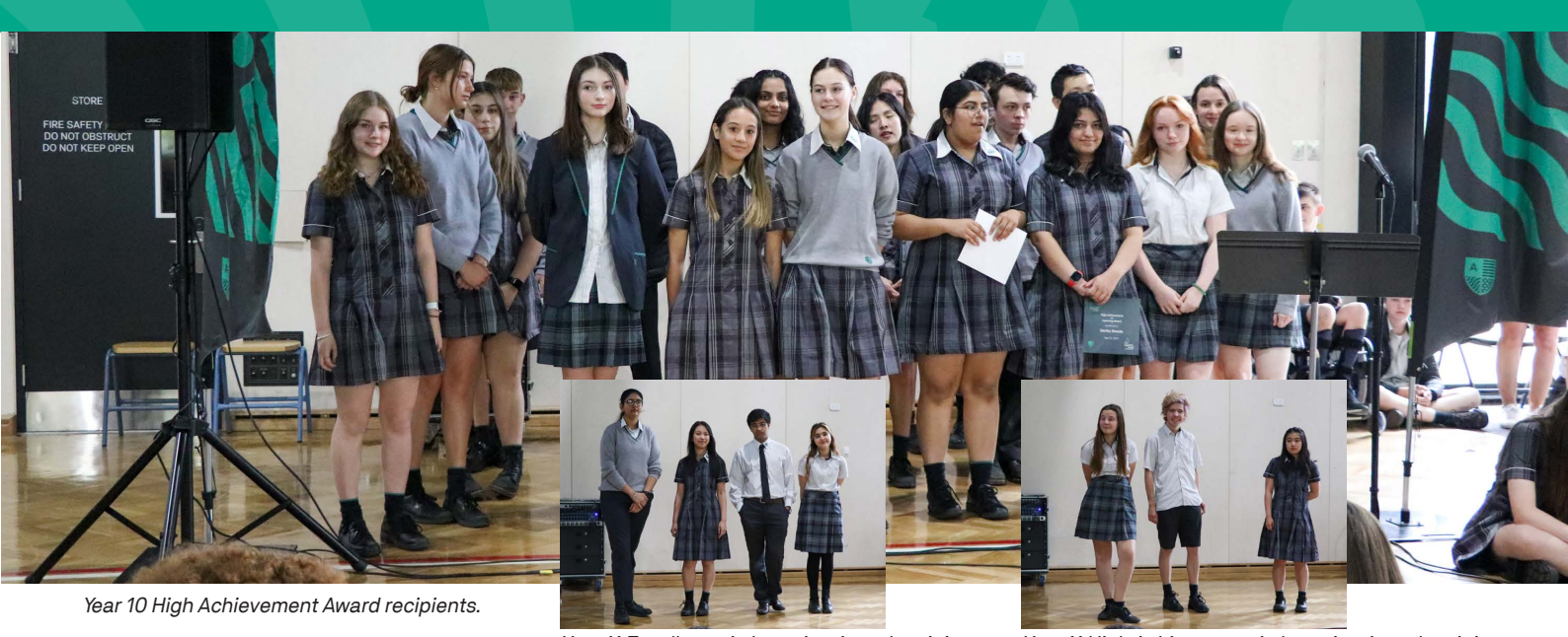
Year 11 Excellence in Learning Award recipients