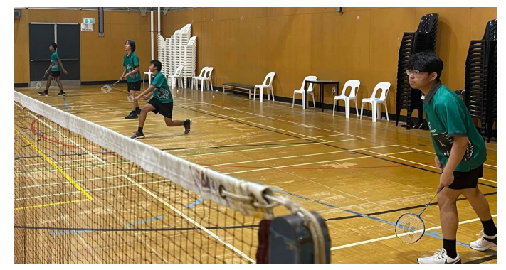
Boys' badminton teams