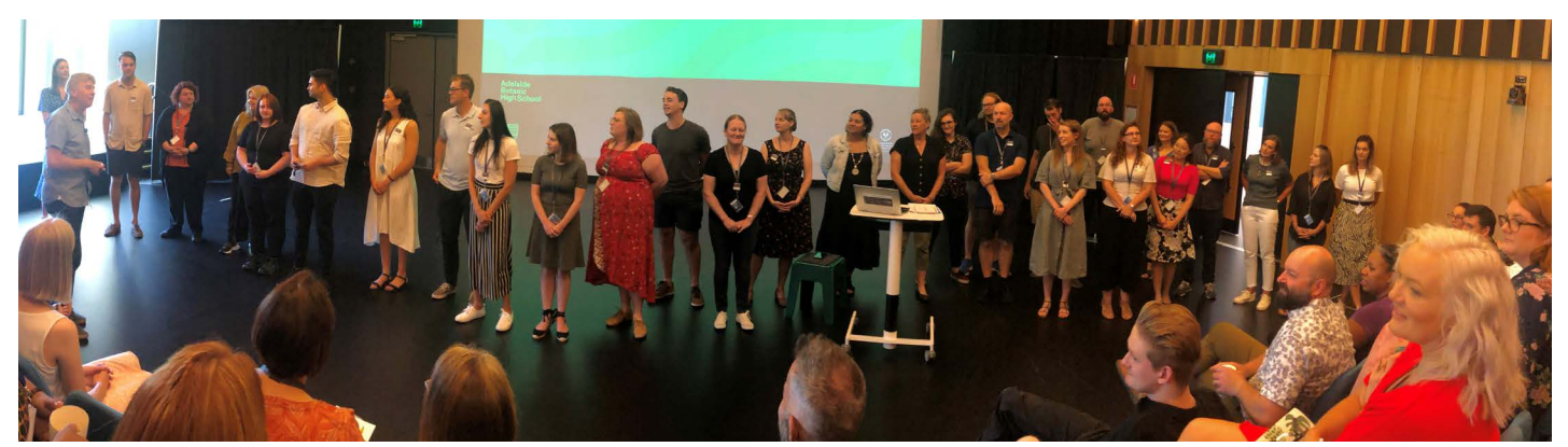
Introduction of 2021 new staff members